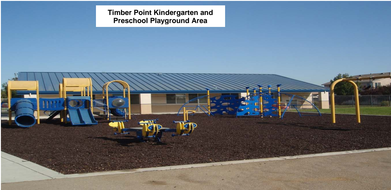
Timber Point Kindergarten and Preschool Playground Area