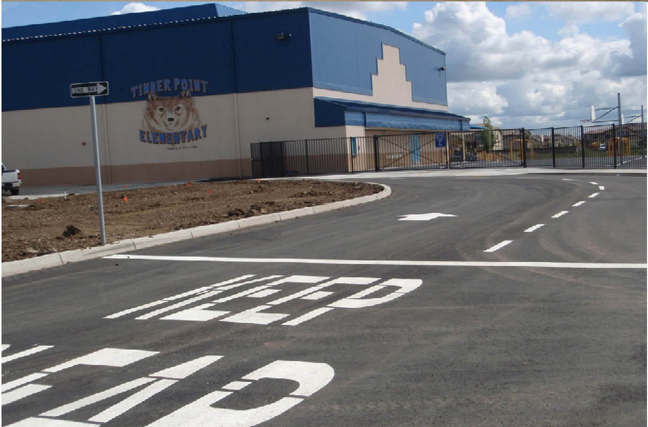
Timber Point Pick Up and Drop off Area