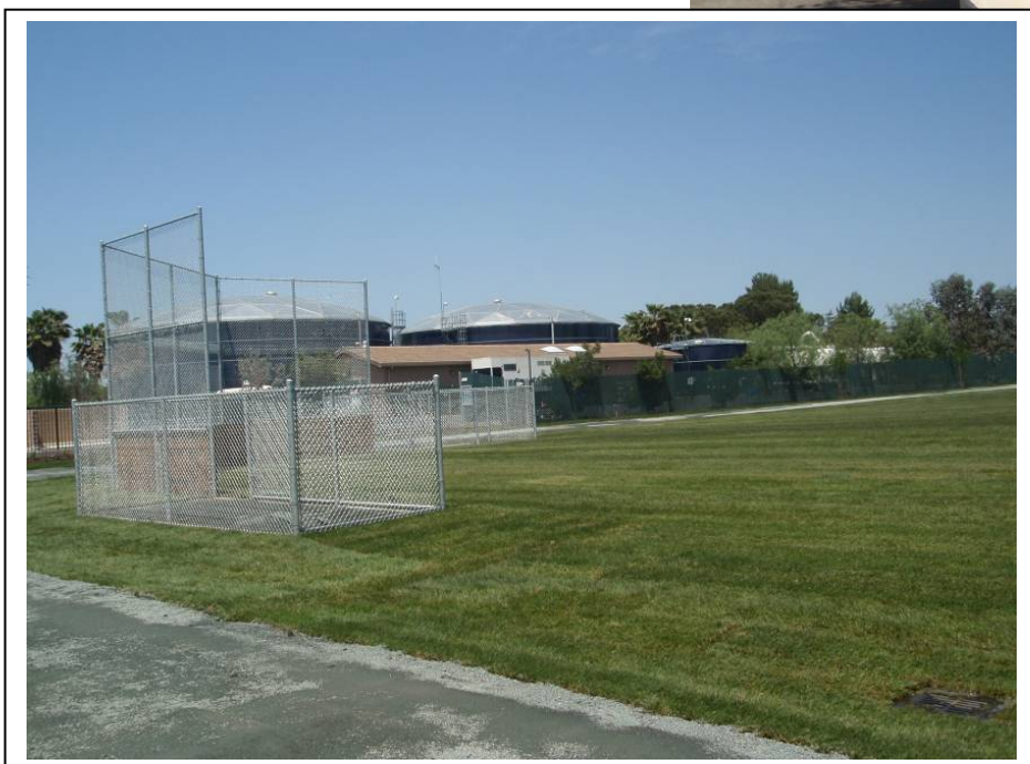
Discovery Bay Sports Field and Track Project