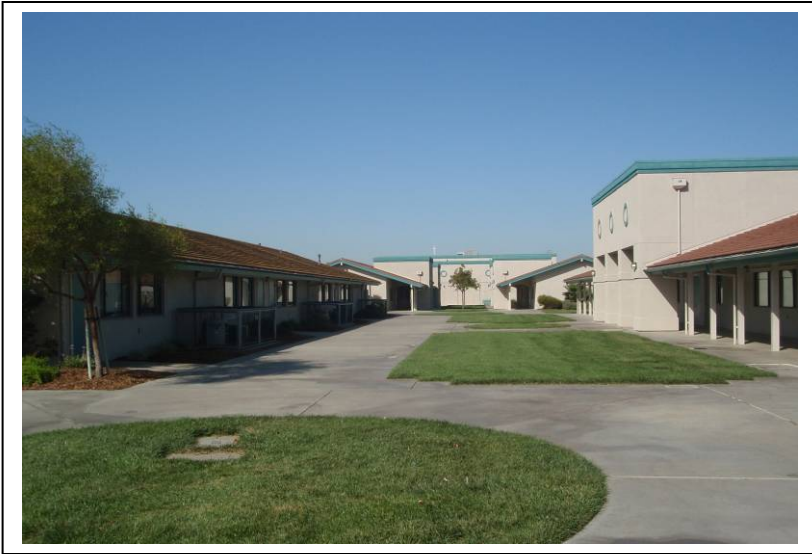
Discovery Bay Plaza Project