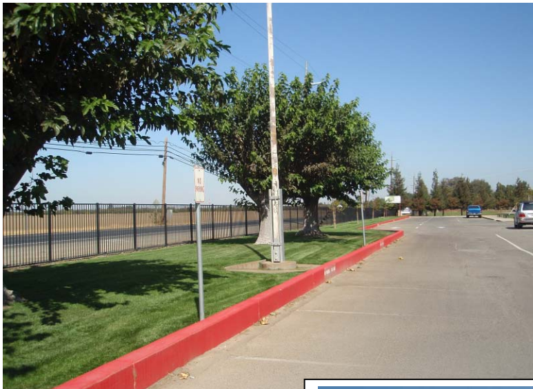
Excelsior Expansion Project